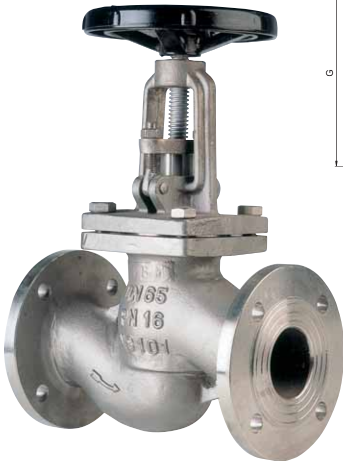
FIG. VS 101 SERIE PN-16